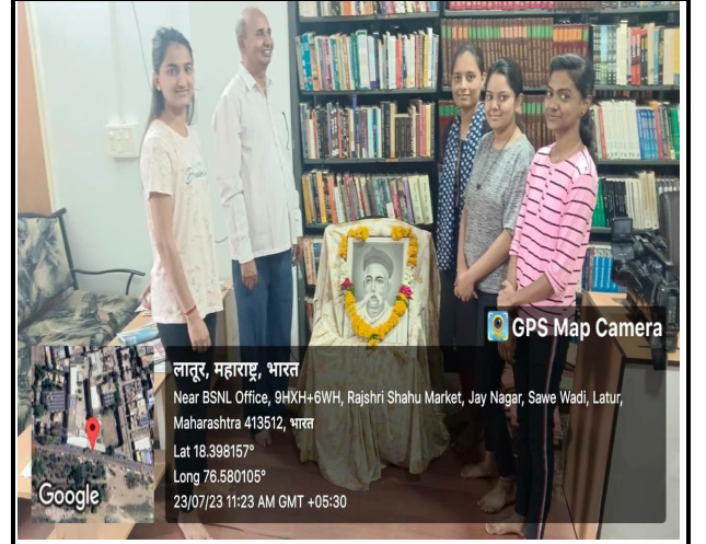
Students participated in Lokmanya Bal Gangadhar Tilak jayanti program.